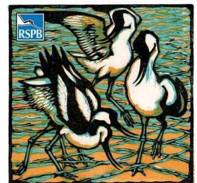
The RSPB Anthology of Wildlife Poetry SELECTED BY CELIA WARREN FOREWORD BY KATE HUMBLE