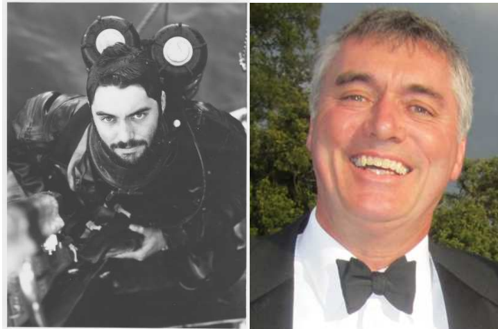
The visible effect of over 30 years of Naval Service