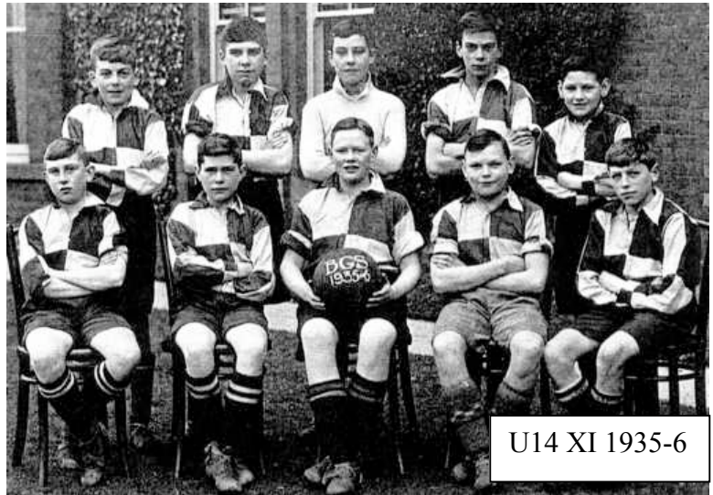
U14 XI 1935-6